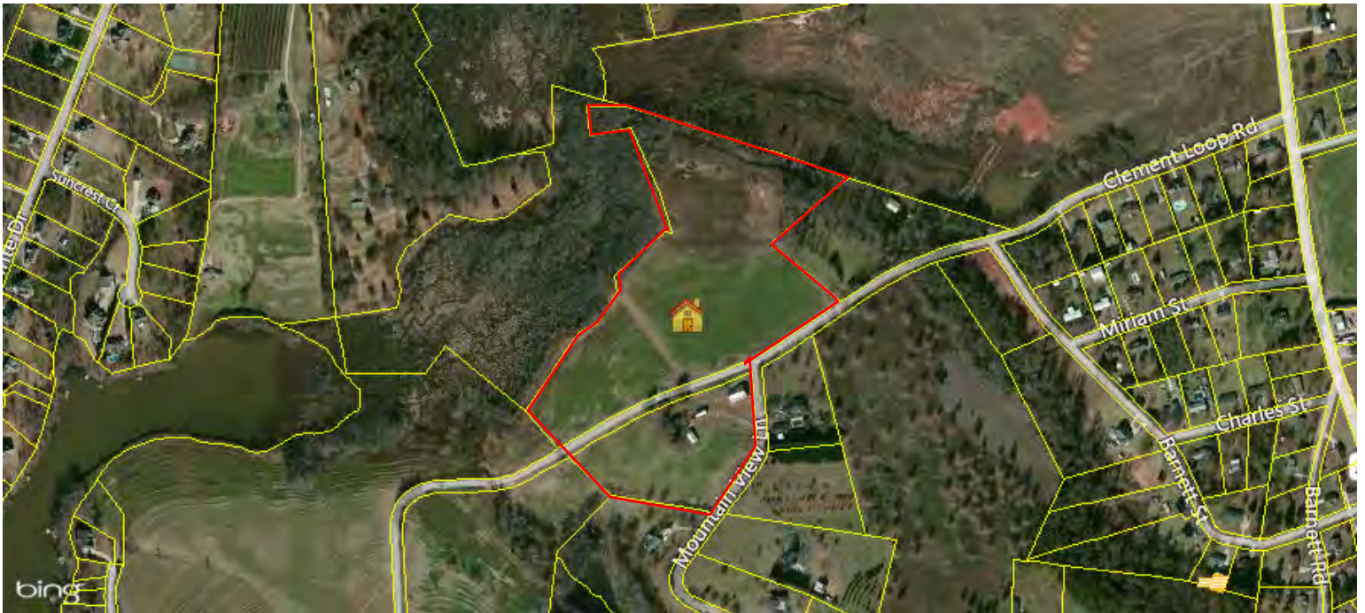
Map for Parcel Address: 220 Clement Loop Rd # 220 Inman, SC 29349-9535, Parcel ID: 1-46-00-026.00

COPYRIGHT © 2013 COURTHOUSE RETRIEVAL SYSTEM. ALL RIGHTS RESERVED. Information Deemed Reliable But Not Guaranteed. Contact Us at (800) 374-7488 ext 3 for Help.